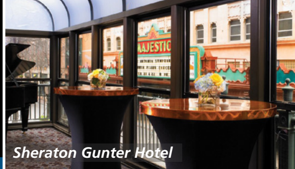
Sheraton Gunter Hotel